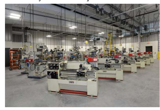
This classroom features a range of computerized tools for precision machining.